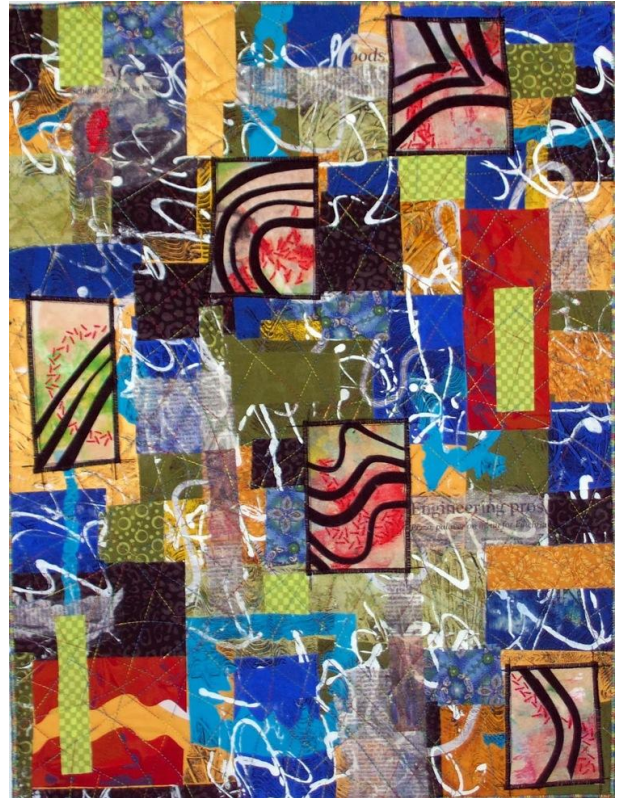
Started in the Sue Benner workshop; finished in the studio