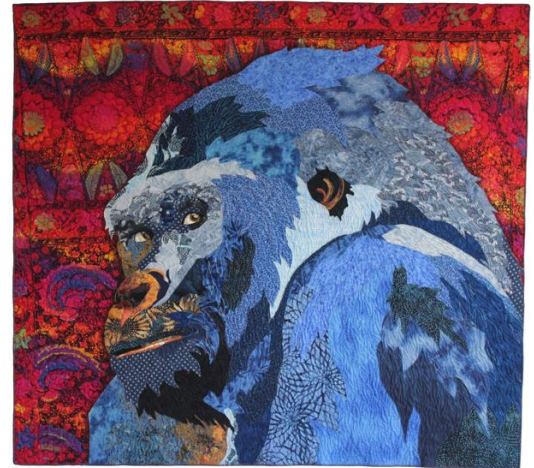
Beauty of the Beasts