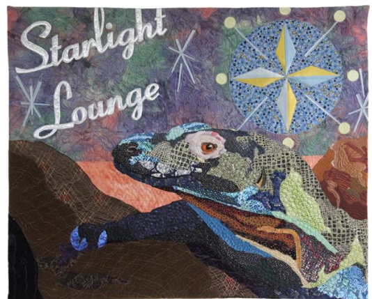
Larry the Lounge Lizard