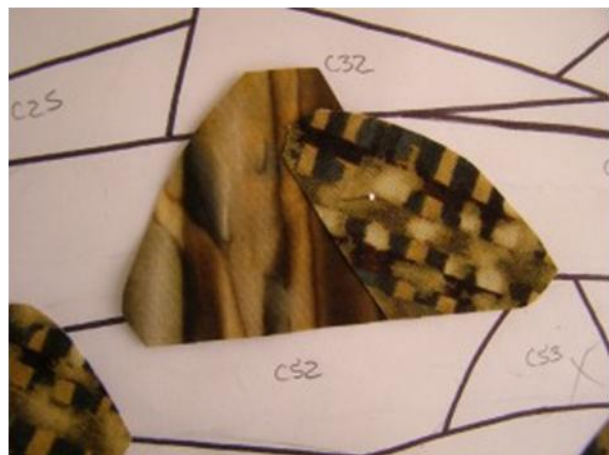
Fabrics for distant bushes